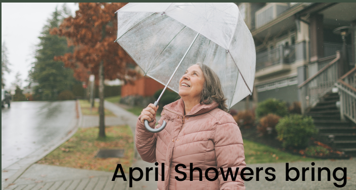
April Showers bring May Flowers