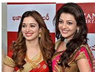
Khazana in expansion mode 16/08/2015