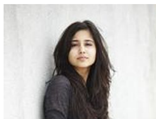
'I am greedy as an actor' 15/08/2015