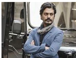
Who is Nawazuddin's hero? 29/08/2015