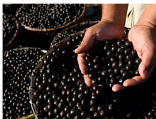
Eight Exotic Superfoods to Boost Your Immune System - For Dummies Dummies.com