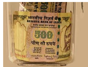
2 Reasons Why Bank Fixed Deposits Alone Won't Make You Rich scripbox