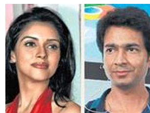
Asin to marry soon 16/08/2015