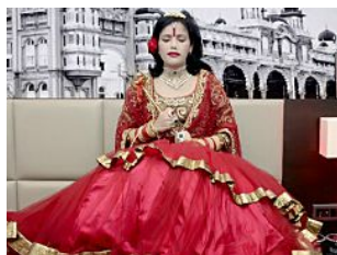
Is Radhe Maa member of Pakistani intelligence agency? News