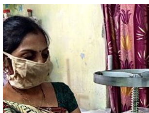
Menstruation Innovation: Lessons from India Nicholas D. Kristof