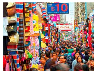
Where to shop in Hong Kong with a budget Discover Hong Kong