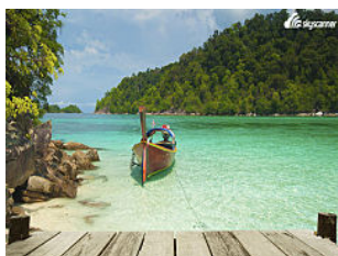
Well-kept secrets of Goa: The best beaches very few know Skyscanner