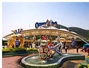
Top 10 places you can't miss when you visit Hong Kong Discover Hong Kong