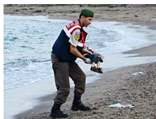
Brutal Images of Syrian Boy Drowned Off Turkey Must Be Seen, Activists Say The New York Times - World