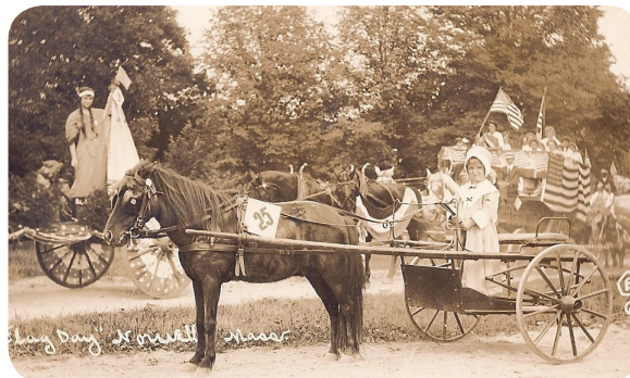
Flag Day Festivities on the Town Common, 1915