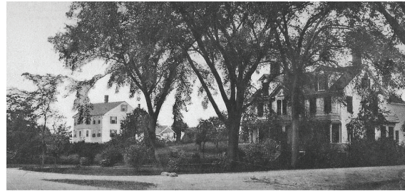
A scene from Main Street is depicted on an old postcard in the Society Archives.