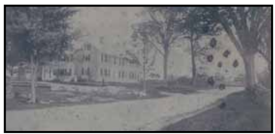
An undated photo of the Jacobs Farm and Route 123 (a dirt road).

ment has contributed to its deterioration. Jacobs Lane was a dead end until recent times. Now, heavy commercial traffic uses it as a