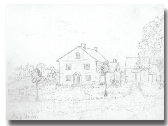
A 1944 drawing of the "Old Homestead" by Arthur Loring Jacobs. The house is located at 99 Jacobs Lane.

Heartily do we thank, commend, and applaud the civic-mindedness of the McHugh family in preserving what we shall now be able to display from time to time over succeeding years.