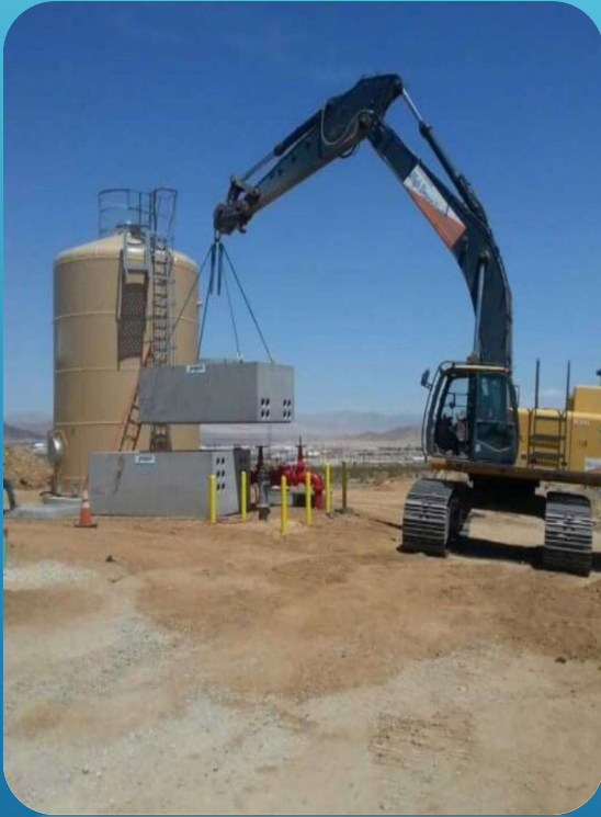
Underground Pipeline and utilities installation