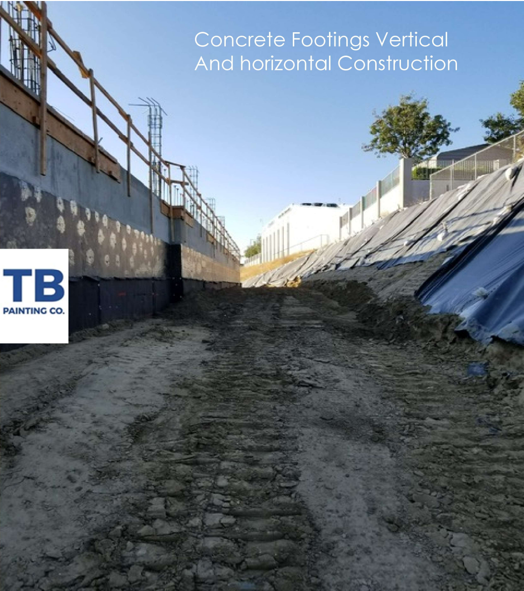
Concrete Footings Vertical And horizontal Construction