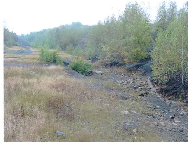
6. Eddy Colliery Site Throop