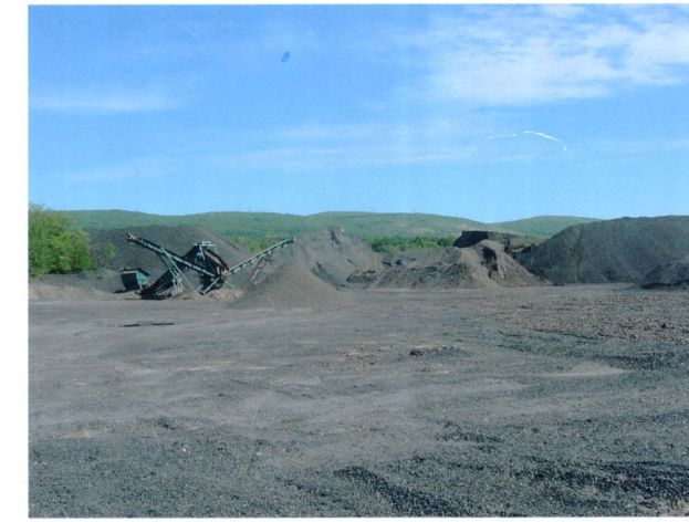
8. Marvine Colliery Site Scranton