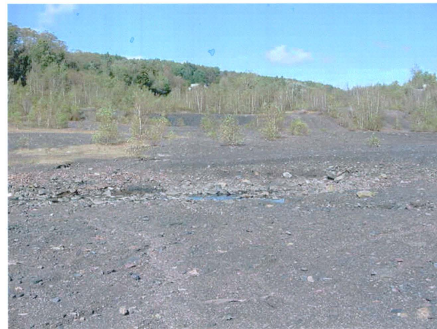
1. Yucca Flats Forest City