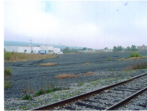
7. Olyphant Colliery Site Olyphant