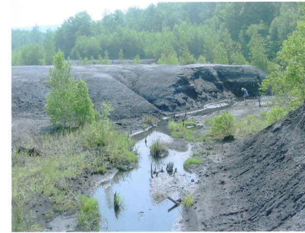
4. Lower Powderly Basin Carbondale Township