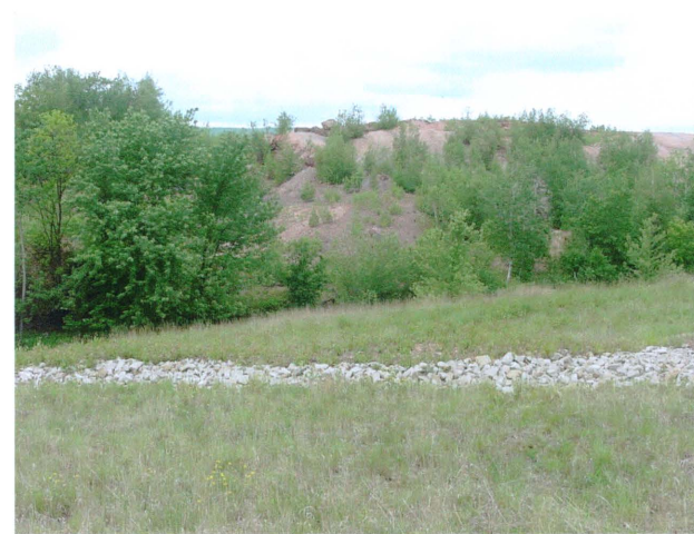
10. Moffat Colliery Site Taylor