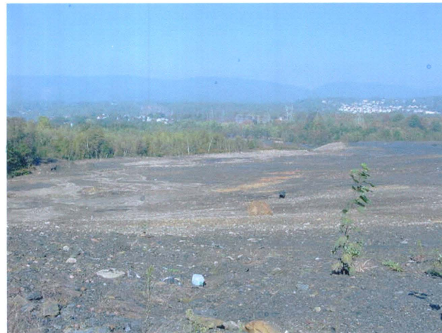
5. Pompey Colliery Site Jessup