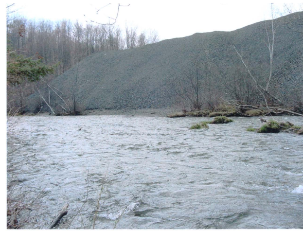
2. Northwest Pile Vandling