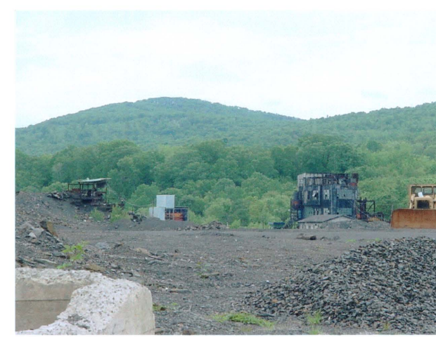
11. Poppel Colliery Site Old Forge/Duryea