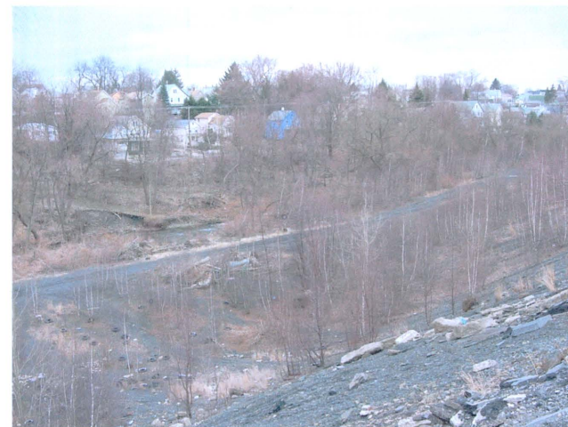
9. Marvine Colliery #6 Site Scranton