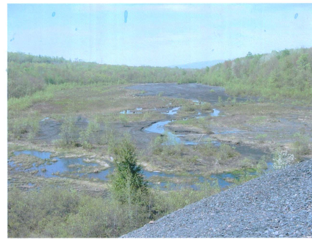
3. Upper Powderly Basin Carbondale Township