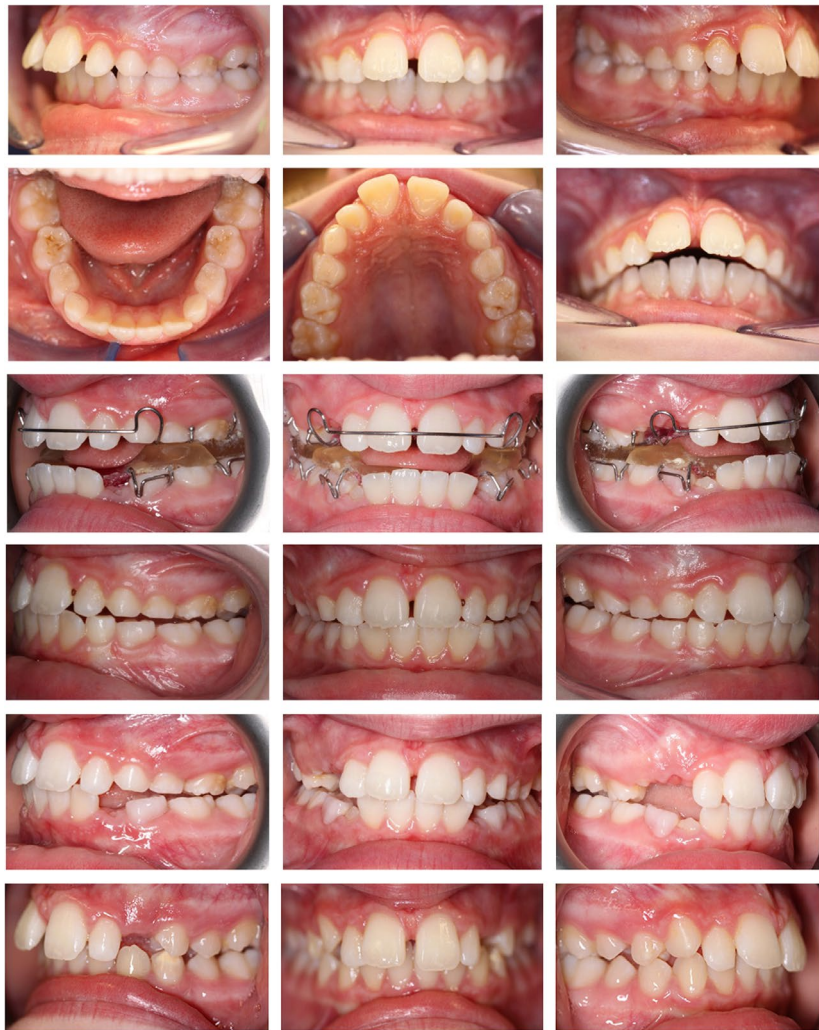
Fig. 1 Treatment of a nine-year-old girl with a significant overjet in the mixed dentition with a twin-block functional appliance. Overjet correction took place very rapidly but a prolonged period of part-time appliance wear was required to maintain this while waiting for progression into the early permanent dentition and the placement of fixed appliances to detail the occlusion. Indeed, progressively reduced wear and ultimately, loss of the appliance, led to some relapse in the sagittal correction as she entered the permanent dentition

So where does all this leave the GDP or orthodontist faced with a young child who has a large overjet? What does the best evidence tell us about the timing of treatment for this child and what advice should we be giving to patients and their parents? These studies do not say that early treatment should be carried out routinely in these children but they do demonstrate that there might be a potential difference in outcomes between those treated early or later. We should also consider some other factors. Apart from a higher risk of trauma, an increased overjet has been associated with a negative impact on oral health-related quality of life (OHRQL) and potentially makes a child more susceptible to victimisation and bullying, 25,26 although early correction does not seem to influence OHRQL. 6 Therefore, it would seem sensible to take a pragmatic approach and incorporate a key principle of evidence-based medicine – using your clinical judgement to do what is best for your patient within the context of the best available evidence. In some children, it would therefore seem prudent to consider early treatment, particularly if there is a perceived greater risk of dentoalveolar trauma or they are being teased because of