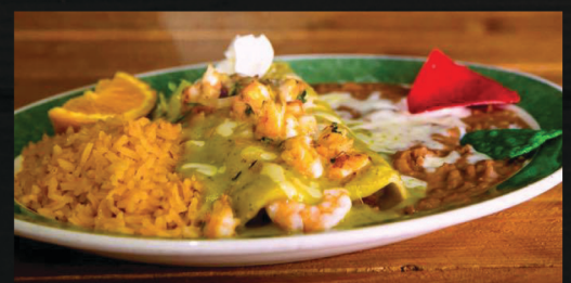
Enchiladas de Camarón

2 enchiladas filled with sautéed shrimp and jack cheese covered in green sauce and topped with sour cream.