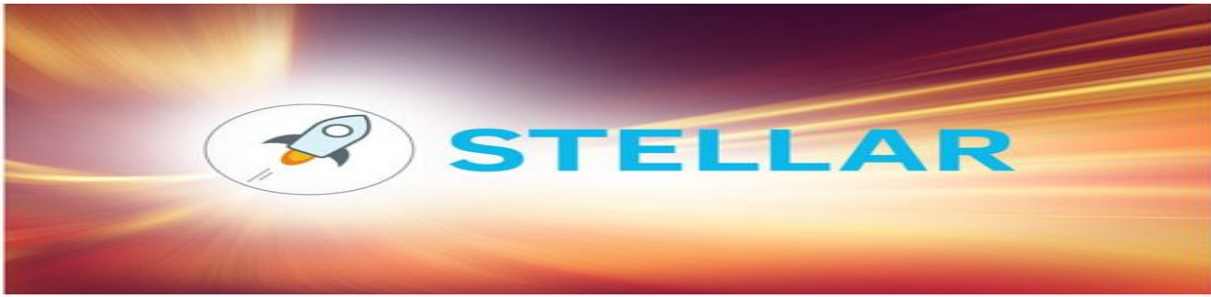
Stellar's Global Payment Platfo...