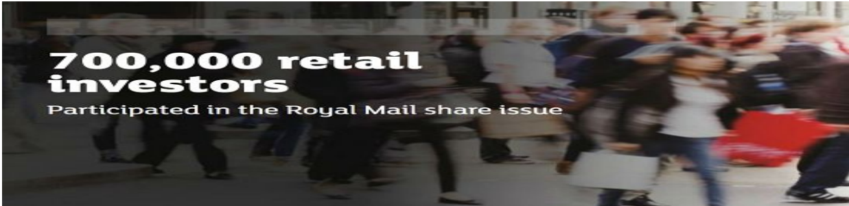
Private investor. Public marke...