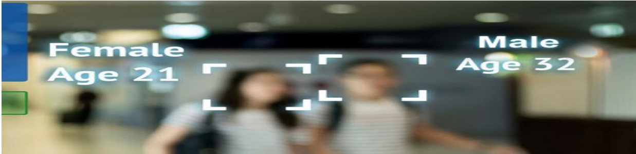
Tencent Partner Selects Invigor...