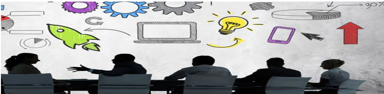
Five financial services trends ...