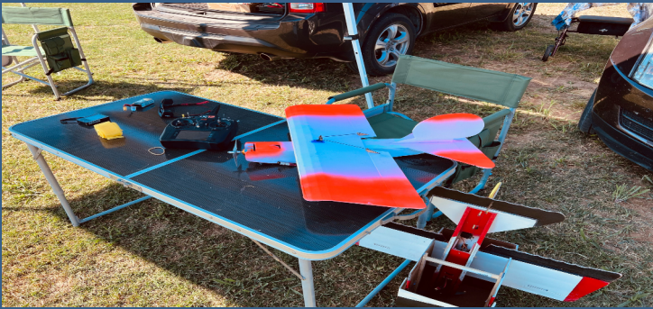
WAMS Hosted the Bloody Baron Contest. Have pictures for us, email to copasvet.0q@icloud.com