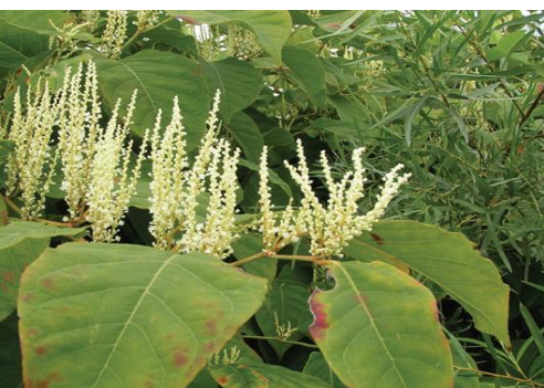
Suzan Campbell, MNFI

Habitat: Japanese knotweed can be found along roadsides, wetlands, wet depression, woodland edges, and stream or river banks. Full sun conditions are preferable, although this plant can tolerate some shade and a wide range of soil and moisture conditions.