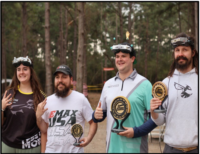
Page 6 of 21