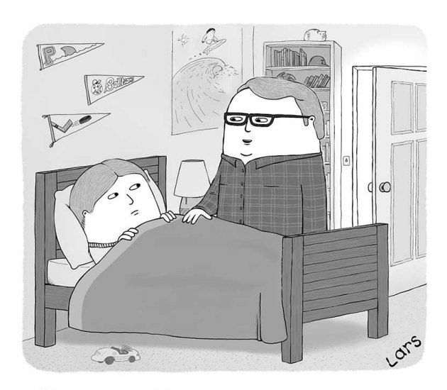
"Trust me, son, if there was a monster under your bed I would have claimed it as a dependent by now."