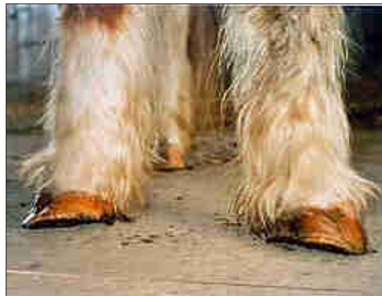
Pony Stella below top row February 2005, below bottom row August 2005