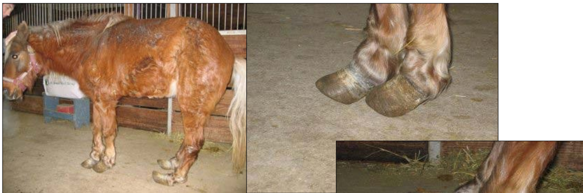
Below: Same pony as on previous pictures, about 1 year later