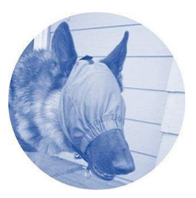
Leo wearing calming cap.

<u>Calming Caps</u> reduce the amount of visual information, which may also be calming (although they are most commonly used to reduce arousal during car rides).