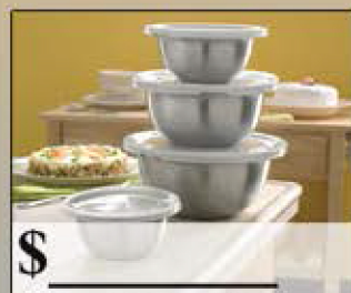
4 pc Mixing Bowls