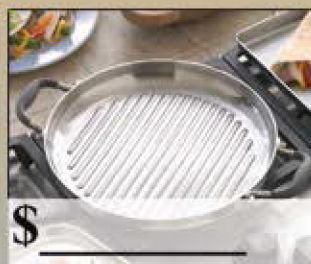
Round Grill Pan