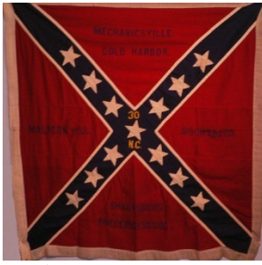
30 th Appomattox Flag