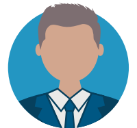
+ Your attorney