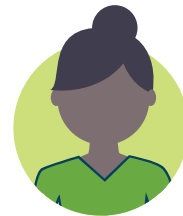
+ Your agent