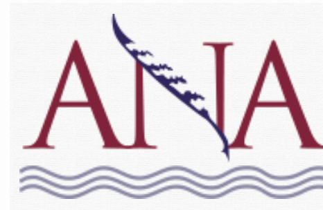
Administration for Native Americans