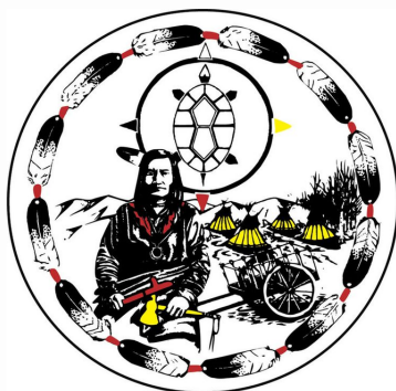
Turtle Mountain Band of Chippewa