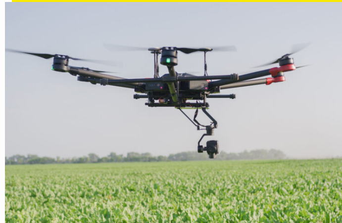
A UND Research Institute of Autonomous Systems UAV is used to inspect a field.

Und will focus on uncrewed aircraft, transportation, energy, national security, and rural health initiatives. The other reginal partners in the grant, as well as their focus areas, are: Tribal Nations Research Group (TMBCI), data protection mining, management, and tribal partner outreach; Montana State University, smart optical sensors; Montana State University MilTech, technology transition from research to commercialization; South Dakota Mines, mining and autonomous mining