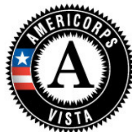
Christa Monette Data Collection