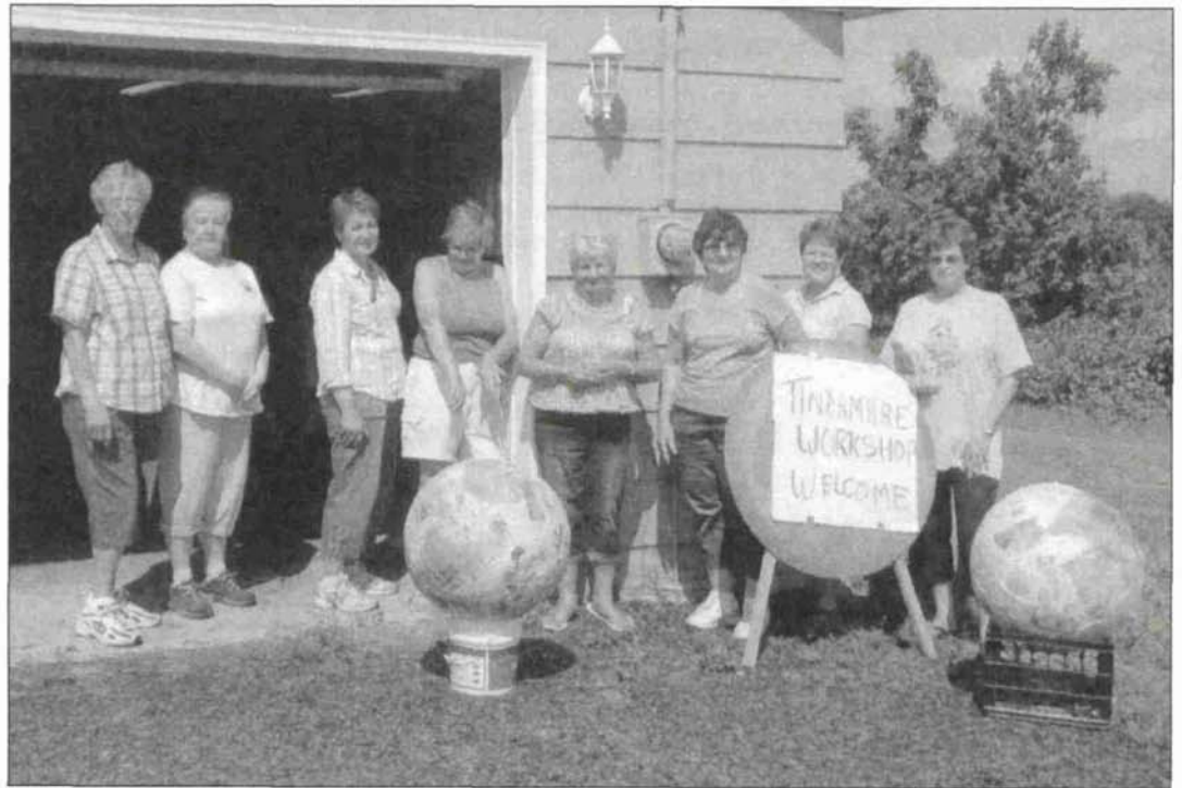
Attending the Tintamarre Workshops in St. Agatha on August 2 and 9, 2012