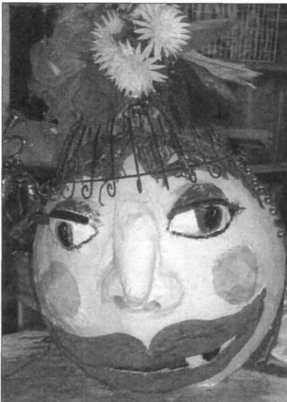
La belle madame