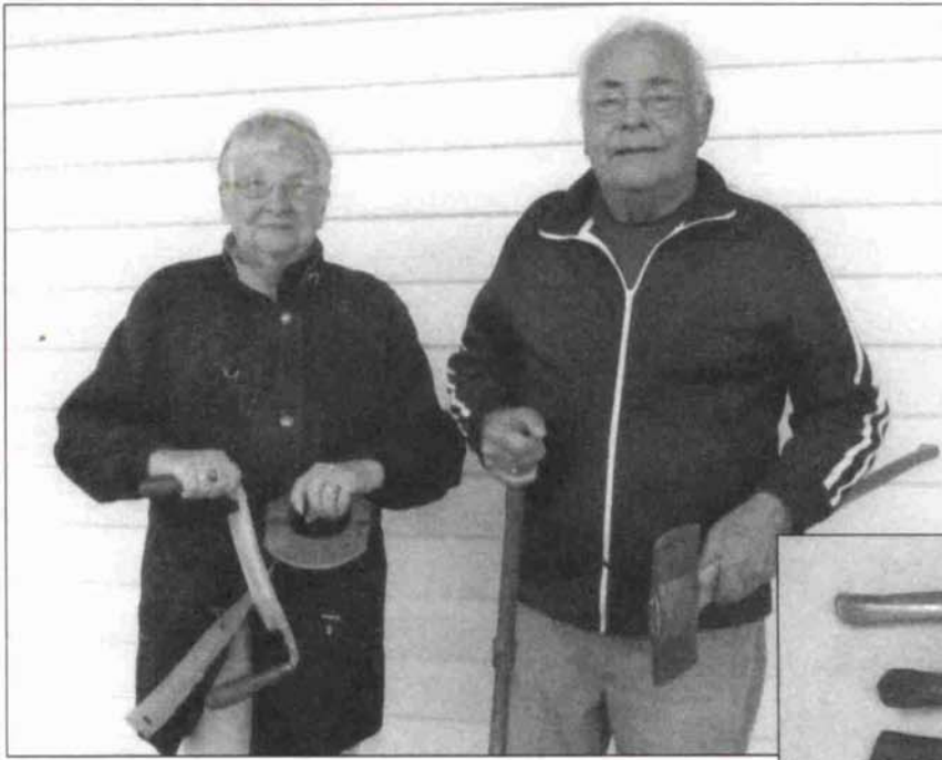
Tools donated by Anita & Roger Chamberland Lewiston, Maine April 26, 2016

Collection donated includes: axe, dtrop, spud, crooked knife, dough cutter, draw knife, awl, saw handles, buck saw*, and cross cut saw*(galandore). * Not in photo