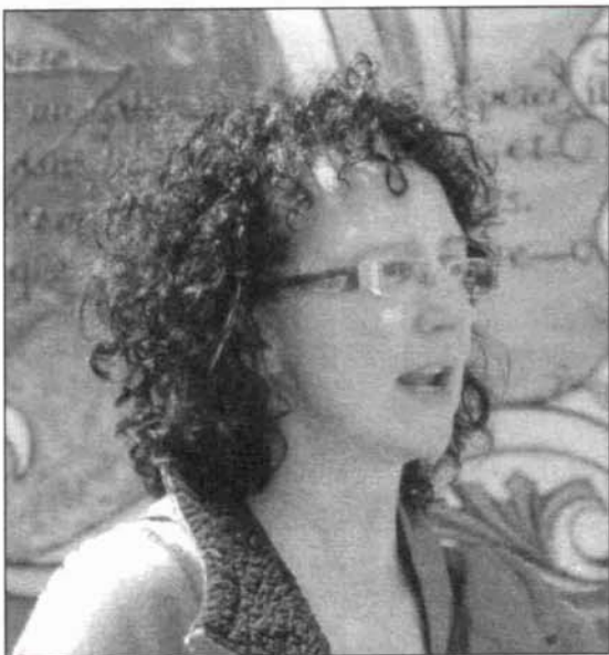
Carmen Massé, Mairesse de Saint-Elzéar