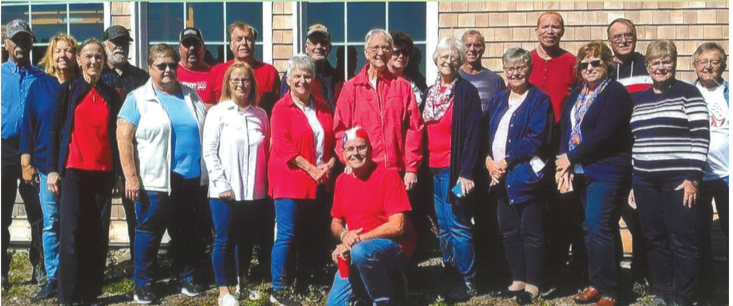
Photo of Board Members, Trail Guides, Groundskeepers, and Longfellow School Volunteers