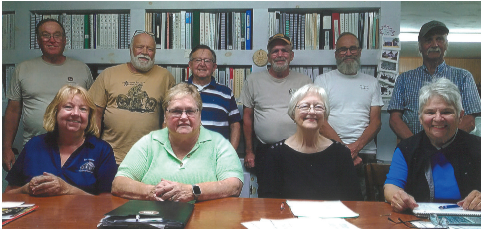
Official photo of Board of Directors - 2023