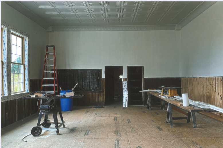
View of the finished ceiling, walls and windows.