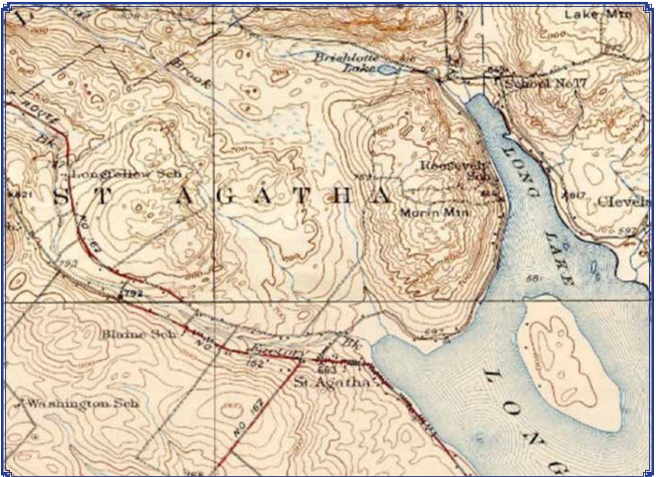
The above map shows the northeast area of Long Lake, which was the location of Philius Chassé's property with the backdrop of Morin Mountain.