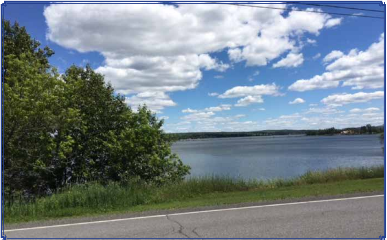
The view of beautiful Long Lake - a view seen from Philius Chassé's farm on Cleveland Road.