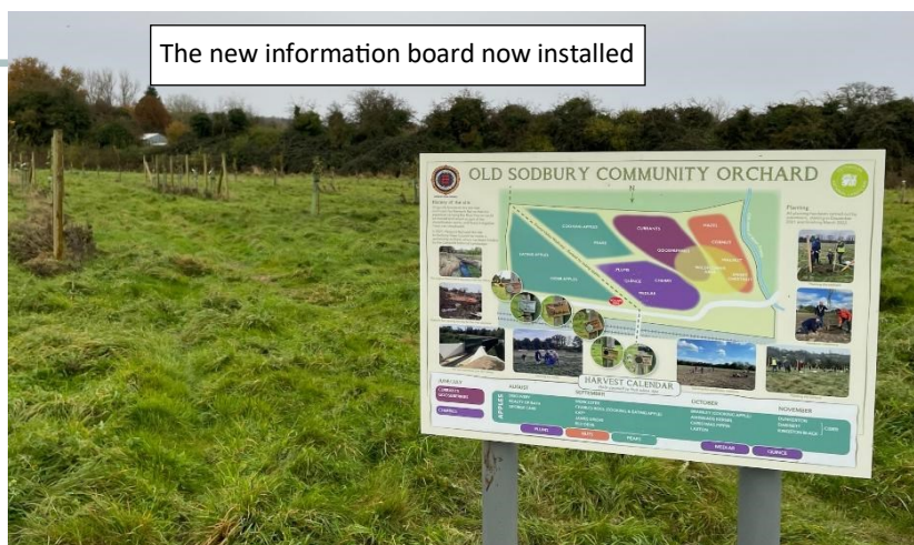
The new information board now installed

For more details contact Richard Wilson 01454 310540 or visit SWaN Facebook page.