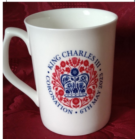
Mug has Old Sodbury on back £10 for adults to buy

At the Village Hall 29 Apr Film Night 7pm 4 May Elections 7am - 10pm 6 May Indoor Street Party 5pm 19 May Coffee Morning 10-12noon At the Football Field 7 May Village Picnic 1pm 10 Jun Village Day 12noon - 5pm At The Church 28 Apr Church Clean 10am 29 Apr Churchyard Tidy 10am