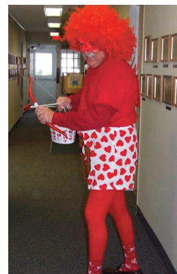
Guess Who? Stupid Cupid!

February is a special month. Having only 28 days in common years. February is the only month of the year that can pass without a single full moon. Using Coordinating Universal Time as the basis for determining the date and time of a full moon, this last happened in 2018, and will next happen in 2037. Almost every fourth year is a leap year. Each leap year the month of February has 29 days instead of 28. During the month of February on the 14th we celebrate Valentine's Day. Over the years (and centuries) Valentine's Day has been a religious celebration, an ancient ritual day, and a commercial holiday. All that change means the meaning of Valentine's Day is truly whatever you want it to be: you can skip the celebrations completely, buy yourself some chocolate or flowers, or express your love and appreciation for the people in your life, whether they are co-workers, romantic partners, friends, or family members. Happy Valentine's Day!