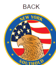
American Legion Post 803 Coin