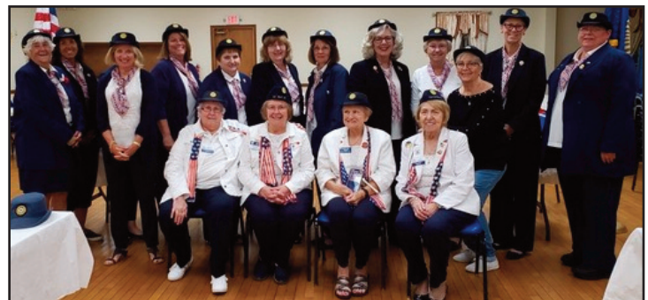
The Auxiliary Team