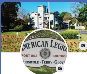
Southold American Legion - Griswold Terry Glover Post 803