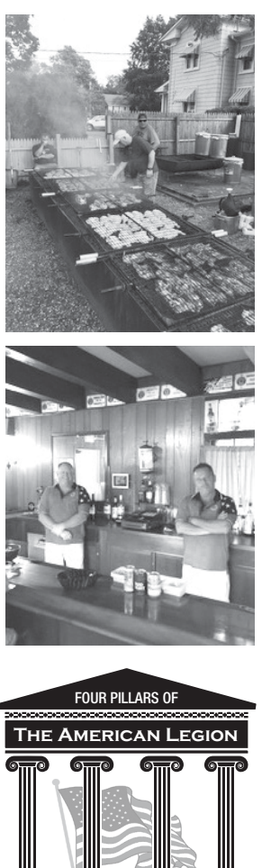
Veterans Affairs National Americanism Children & Security & Xouth