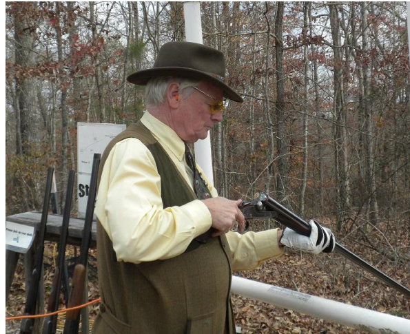
The President with his Boss.