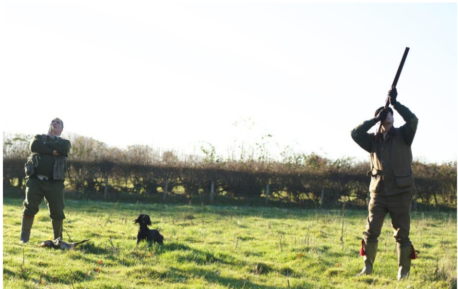
Bob Holliday in Action

The Beacons Shoot provides a great value for the money. Included in the price is all shooting, three meals-a-day, transportation and lodging. Tips and airfare are about all that is not included. The shooting is excellent with challenging and sporting birds, but it is not the super-high birds often written about, which require special experience and practice. The bags each day also were not "high-volume" but everyone had plenty of shooting. This is a great trip for anyone looking for their first taste of driven shooting, or for the experienced shot who simply wants everything taken care of so he can show up and