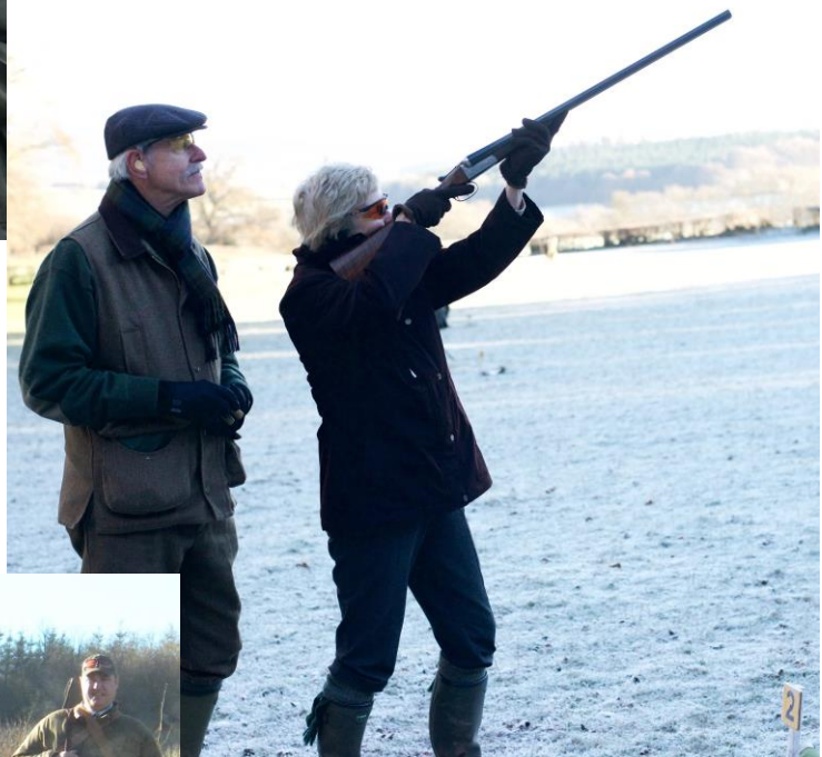
Judy Holliday in action