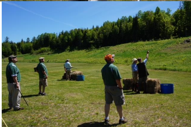
Checking out flight plans