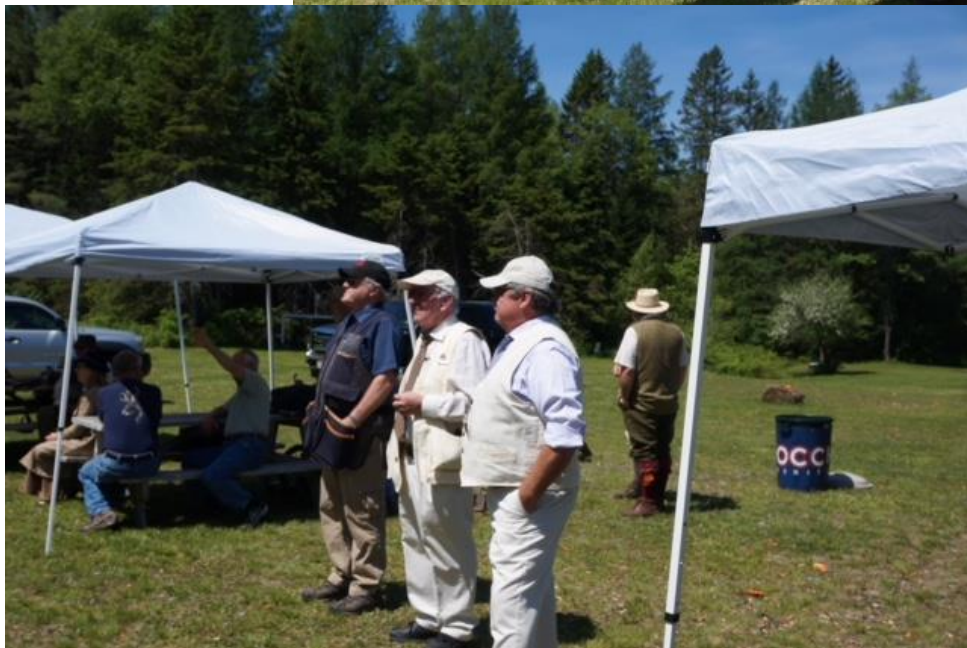
The Strategy Session