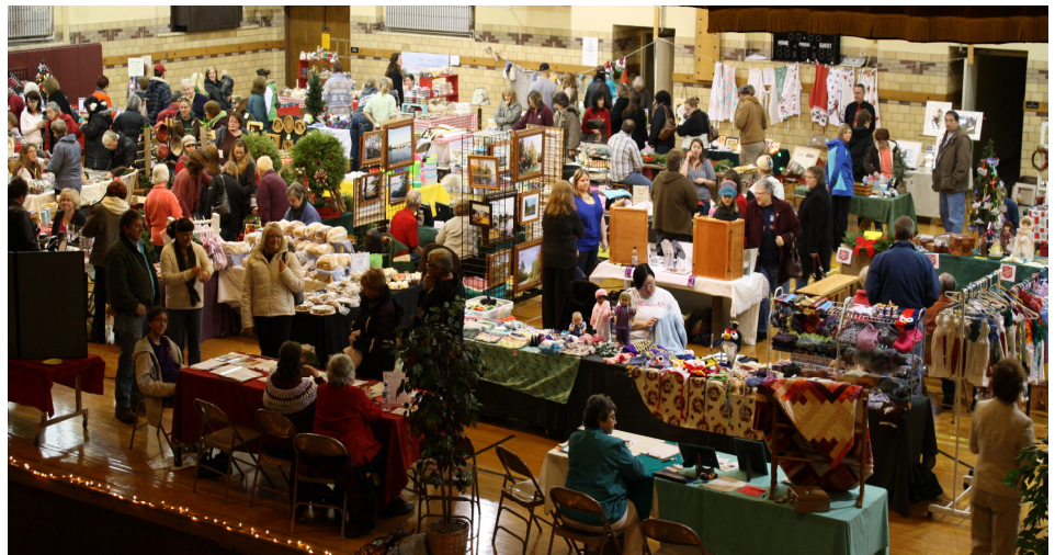
Holiday Arts & Crafts Festival had 30 vendor tables and 300 visitors!