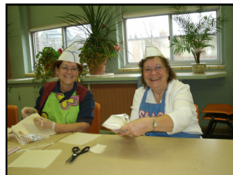
EGG ROLL MAKING CLASSES