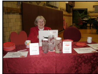
"A CHOCOLATE AFFAIR"