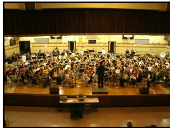
ALL SCHOOL MUSIC FESTIVAL