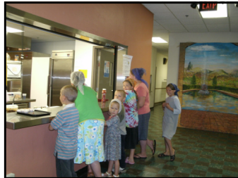
SUMMER FOOD SERVICE PROGRAM