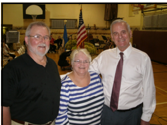
SPECIAL GUESTS SUCH AS GOVERNOR MARK DAYTON