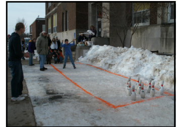
ICE BOX DAYS TURKEY BOWLING