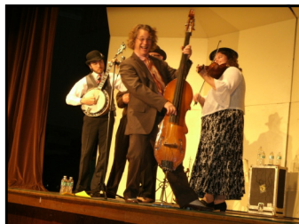
A VARIETY OF MUSIC CONCERTS