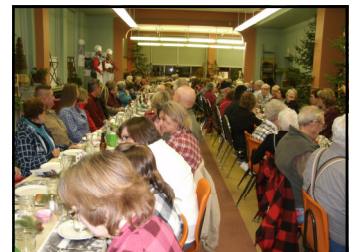
VARIOUS DINNERS & LUNCHEONS