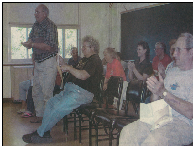
TEN YEARS AGO, A DEDICATED GROUP OF INDIVIDUALS WERE AWARDED PURCHASE OF THE BACKUS/AB BUILDING COMPLEX FROM THE SCHOOL DISTRICT.

This fall marks the ten-year anniversary since Citizens for Backus/AB acquired possession of the Backus and Alexander Baker buildings. Needless to say, a lot has happened in the decade from 2002 to 2012. During a recent cleaning and re-organizing of the Backus Director's Office, I came across copies of news clippings, old Daily Journals, board agendas, minutes, letters, posters, programs and notes. Some items merited saving while others went in the recycle box. What was most interesting was a 55-page packet of photo copies of Daily Journal articles and "Letters to the