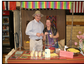
ETHNIC FOOD FESTIVAL