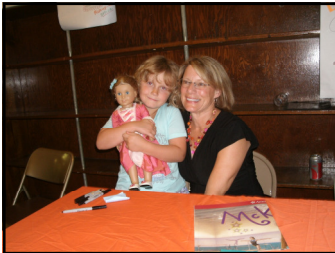
SPECIAL COMMUNITY EVENTS