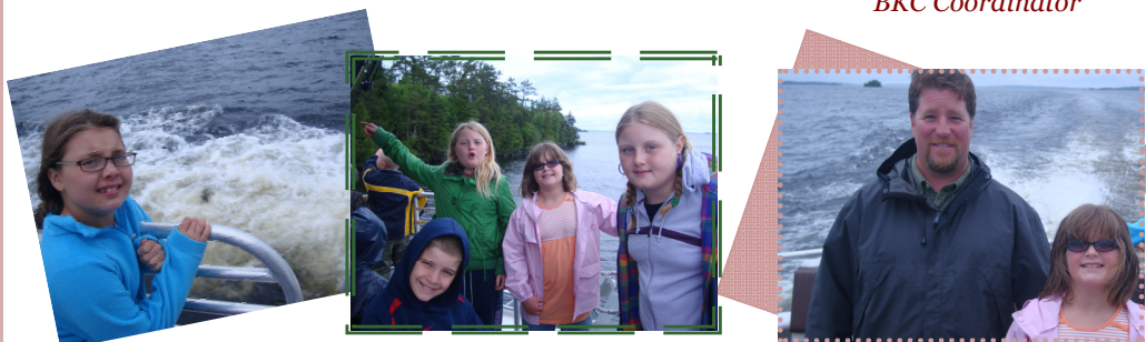
Backus Kids Club at Voyageurs National Park