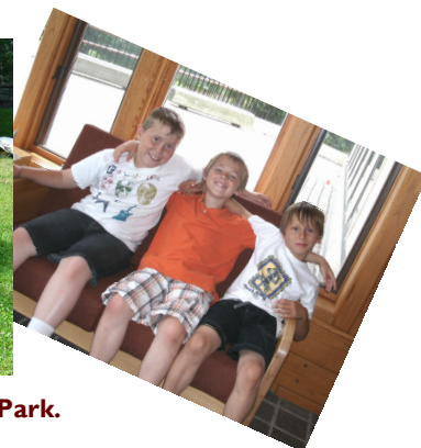
The Backus Kids Club on a field trip at Voyageurs National Park.