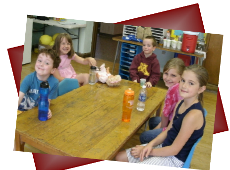
A small portion of the Backus Kids Club.

“We believe the Backus/AB complex will serve the International Falls community well into the next century.”