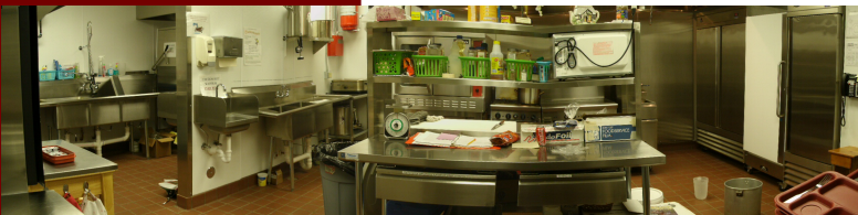
The finished kitchen.