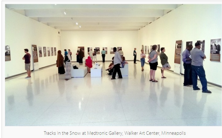
Tracks in the Snow at Medtronic Gallery, Walker Art Center, Minneapolis

It's not often that we get to learn about the journeys of people from diverse backgrounds. It's not often that we get to walk in the shoes of our neighbors, and reflect about the growth of our community in a meaningful way.