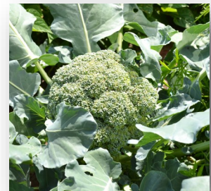
Another featured vegetable that has grown quite large! A broccoli head that was used to make salad.