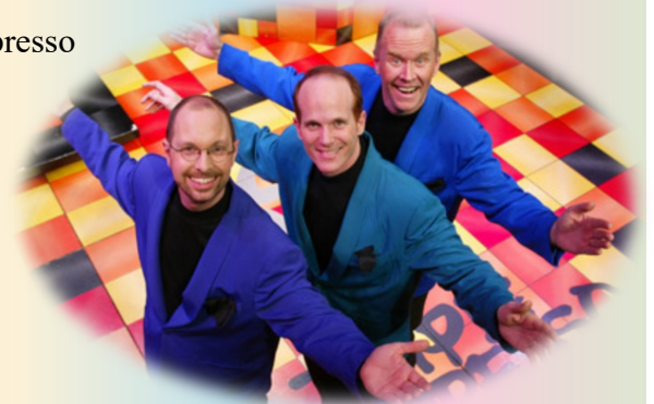
Featured: Triple Espresso Nov. 5th