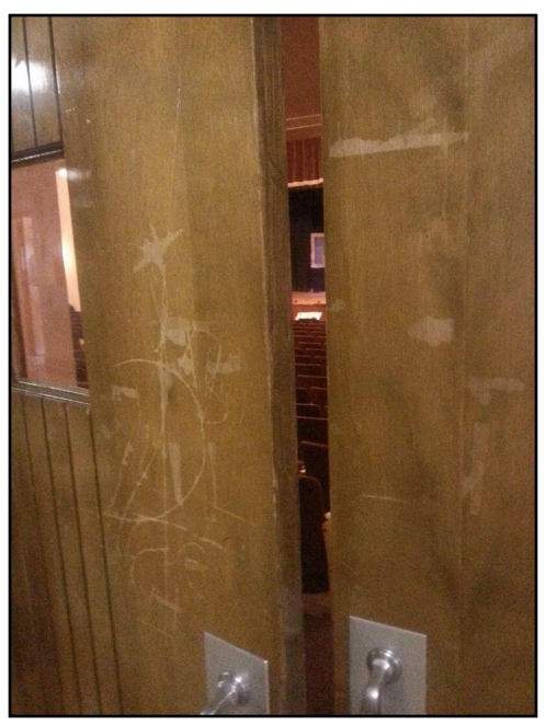
Above, doors before refinishing