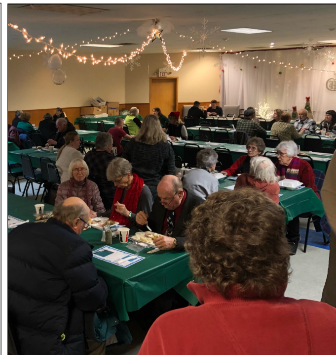
458 meals were served at this year's Elks' Christmas Dinner. Donations went to "Feed Just One" for Community Cafe.

You'll be investing in our community. Backus donations are tax deductible.