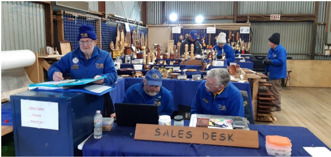
Just a few pics from the Sheep and Wool Show