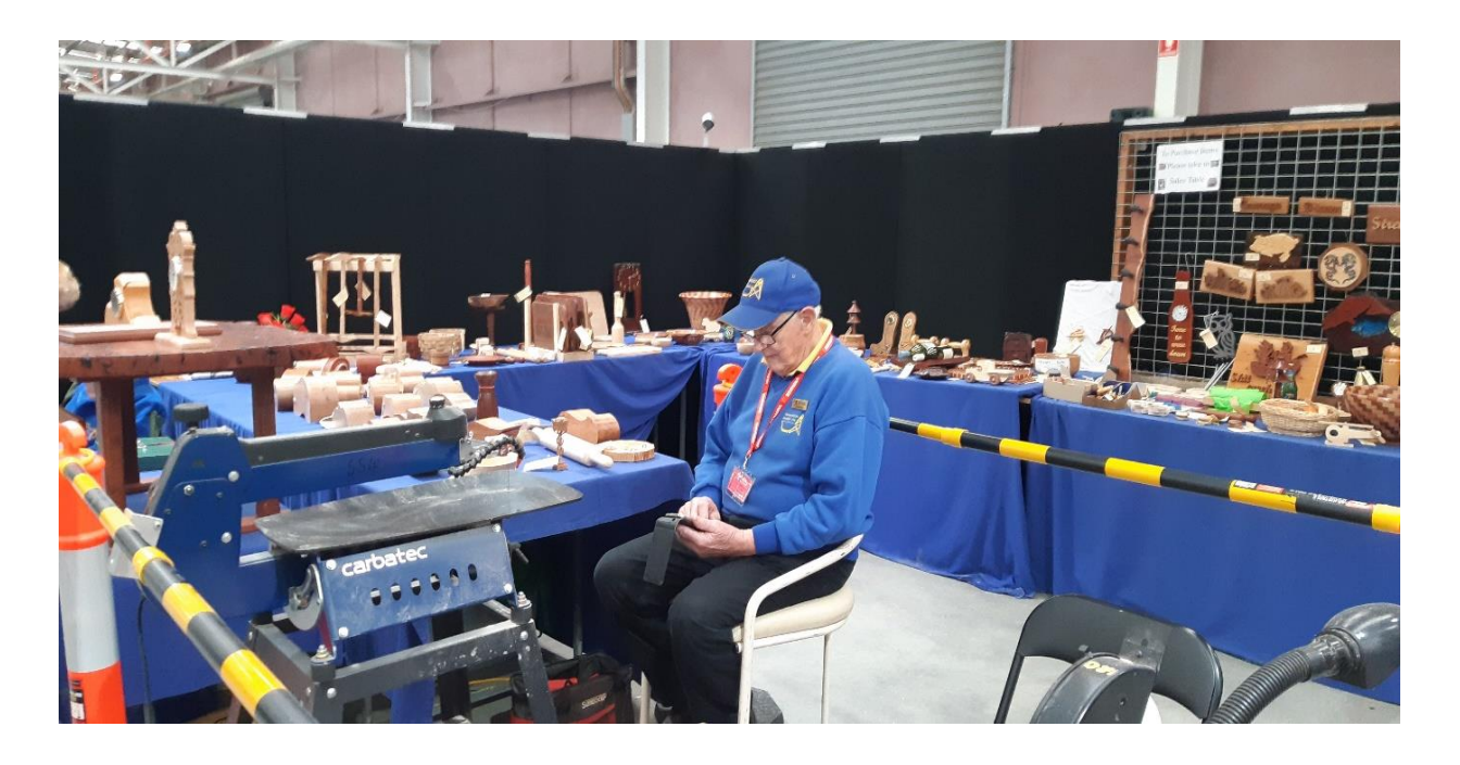
Who says you can't teach the old and bold new technology.