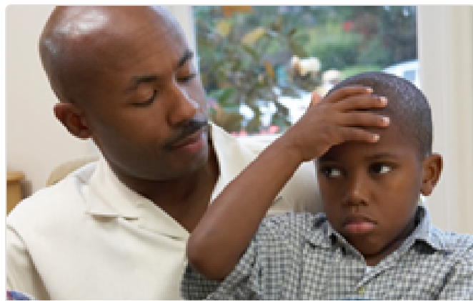
Concussion Signs and Symptoms