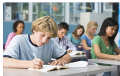
Returning to School