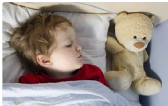
Recovery from Concussion