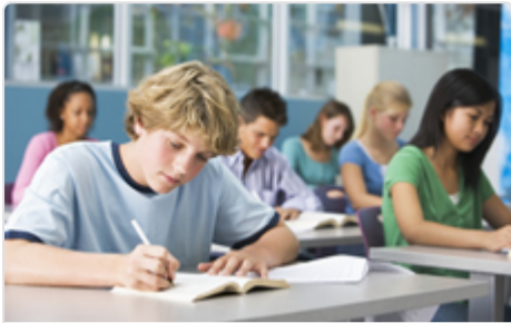
Returning to School