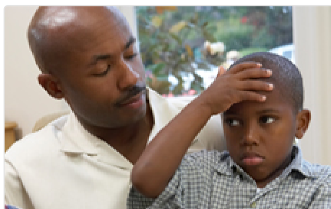
Concussion Signs and Symptoms