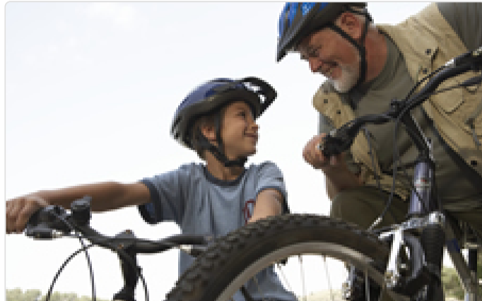
Brain Injury Safety and Prevention