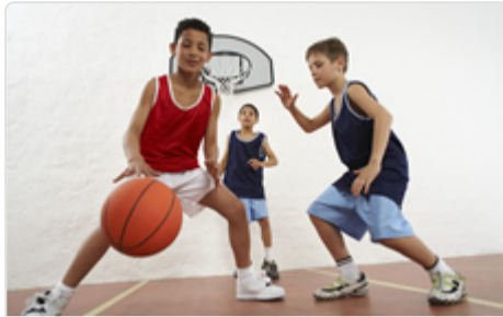
Returning to Sports