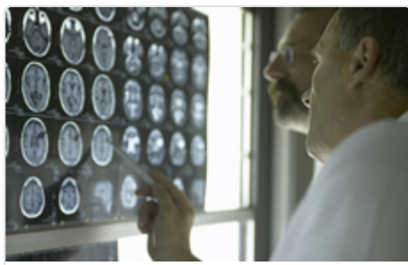
Severe Brain Injury