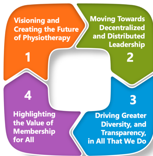
Figure 1: Making the Connection, and Moving Forward Together

I seek your nomination as President because I believe in a future where we, the global and diverse community of physiotherapists, confront challenges together and where the voice of each physiotherapist is heard. There is no doubt in my mind that our future will be better than our past, and I believe that I have the experience and passion to lead World Physiotherapy into its next phase. I present to you a model of priorities that I believe to be template for the future of World Physiotherapy (See Figure 1).