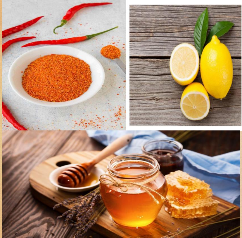
Cayenne Pepper, Honey, and Lemon