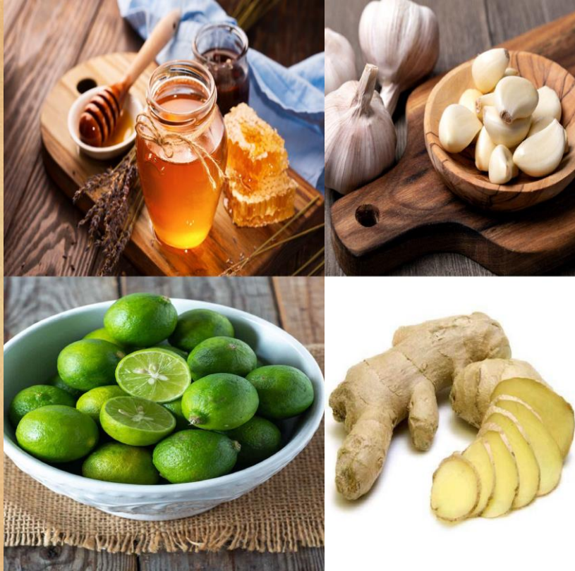
Honey, Lime, Ginger, and Garlic