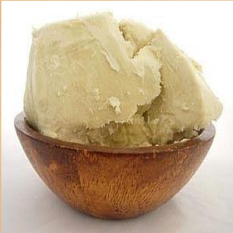
Raw Shea Butter