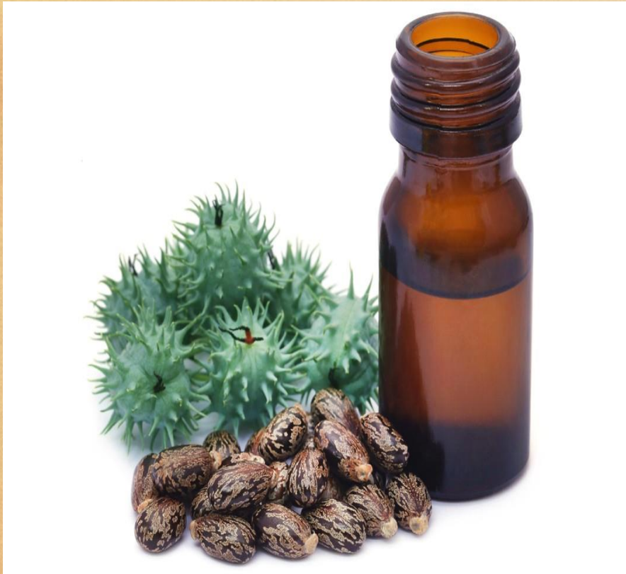
Pure Jamaican Black Castor Oil