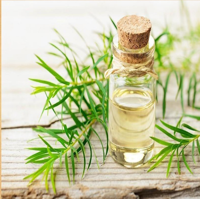
Tea Tree Oil

Tea tree oil can be used as a natural cleanser that will help to clean the scalp.