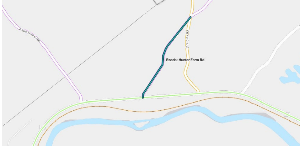
showing Hunter Farm Road near Douglas Drive