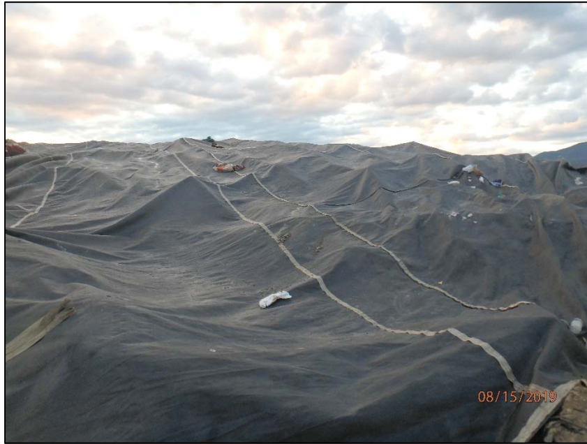
P8150007: Representative photograph of the tarp used as daily cover in the southern portion of Stage IV/Phase II, as viewed from the west and looking upslope in an easterly direction.