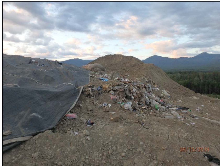
P8150006: Southern portion of Stage IV/Phase II, prior to the working face being uncovered. Looking south. Pile of soil cover mixed with debris present in the center of the photograph; pile of soil cover present in the background of the photograph.