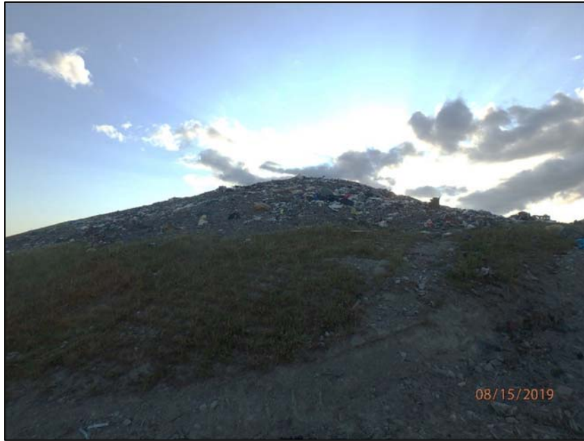
P8150022: Overview of the working face in the western portion of Stage V/Phase II, as viewed from the west and looking in an easterly direction.