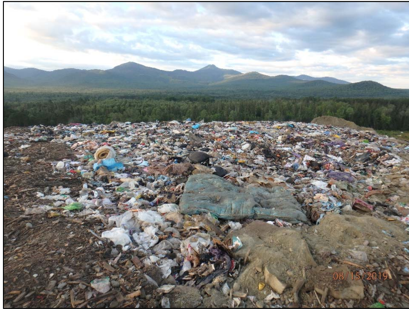
P8150019: Working face in the southern portion of Stage IV/Phase II following the removal of the daily cover tarps, as viewed from the north and looking in a southwesterly direction.