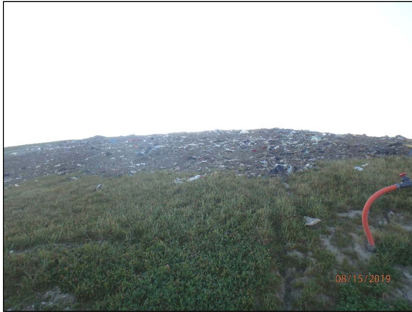
P8150024: Working face in the western portion of Stage V/Phase II, as viewed from the west and looking upslope in an easterly direction.