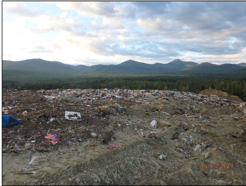
P8150017: Overview of the working face in the southern portion of Stage IV/Phase II following the removal of the daily cover tarps, as viewed from the north and looking in a southerly direction.