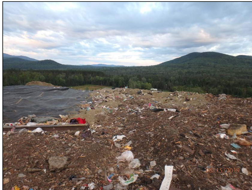
P8150002: Working face in the southern portion of Stage IV/Phase II, prior to the working face being uncovered. Looking west. Exposed waste is visible along the northern edge of the daily cover tarp.