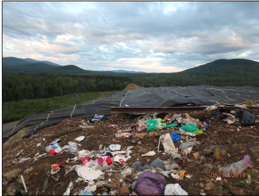
P8150003: Working face in the southern portion of Stage IV/Phase II, prior to the working face being uncovered. Looking west.