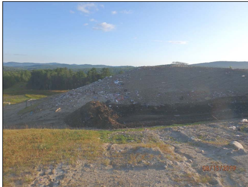
P8150025: Working face in the western portion of Stage V/Phase II, as viewed from the south. Prior to this photograph, NCES personnel removed a limited layer of cover material on the southern edge of the Stage V/Phase II working face to create room in which to deposit a load of sludge.