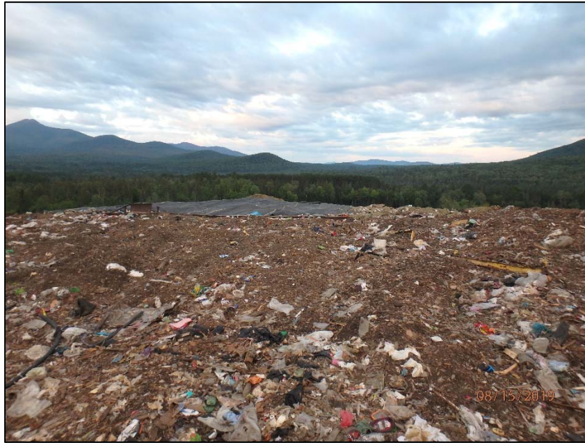
P8150001: Overview of the southern portion of Stage IV/Phase II, prior to the working face being uncovered. Looking west. The tarps present in the center of the photograph are the approximate location of a working face.