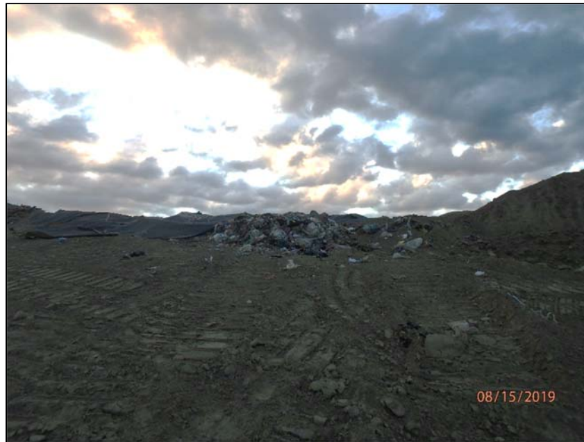
P8150008: Working face in the southern portion of Stage IV/Phase II, prior to the working face being uncovered, as viewed from the west and looking upslope in an easterly direction. Pile of soil cover mixed with debris present in the center of the photograph; pile of soil cover present on the right of the photograph.