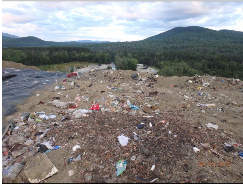
P8150005: Southern portion of Stage IV/Phase II, prior to the working face being uncovered. Looking west. Exposed waste is visible beyond the northern edge of the tarp.