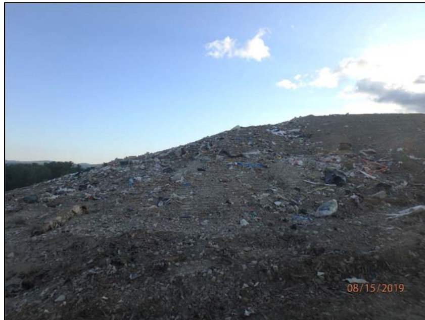
P8150021: Working face located in the western portion of Stage V/Phase II, as viewed from the south and looking in a northerly direction.