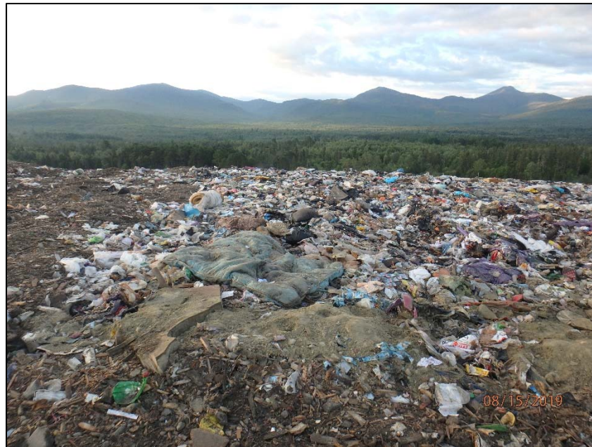
P8150018: Working face in the southern portion of Stage IV/Phase II following the removal of the daily cover tarps, as viewed from the north and looking in a southerly direction.