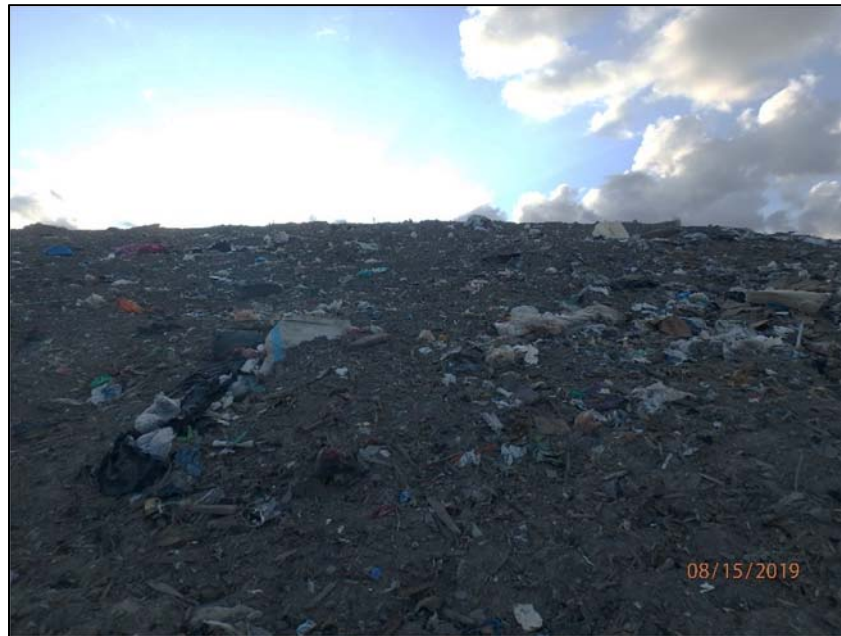
P8150023: Working face located in the western portion of Stage V/Phase II, as viewed from the west and looking upslope in an easterly direction.