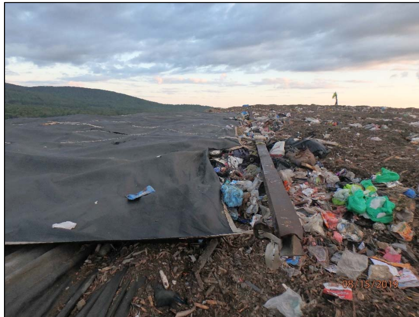
P8150004: Working face in the southern portion of Stage IV/Phase II, prior to the working face being uncovered. Looking north.